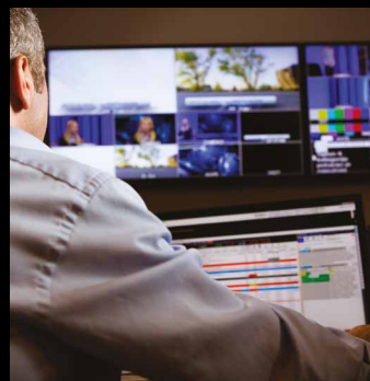
Video Switching and Extension