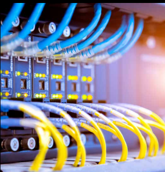
KVM Switching and Extension