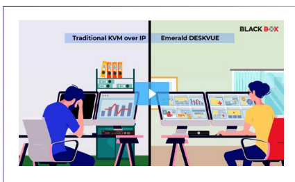
Video: What makes Emerald DESKVUE Different from traditional KVM ▶

Click on the video preview images below to get a demo of Emerald DESKVUE: