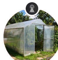
Soil pH and moisture sensor