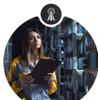
Various Sensors for Quality Control