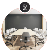
Air Quality/People Count Sensor