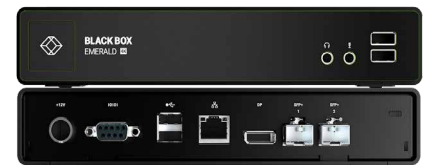
Emerald 4K Receiver (EMD4000R)