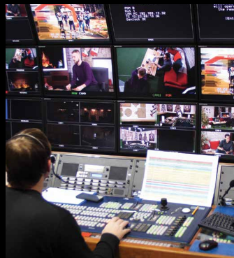
Video Wall Controllers