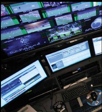
KVM Matrix Switching and Extension