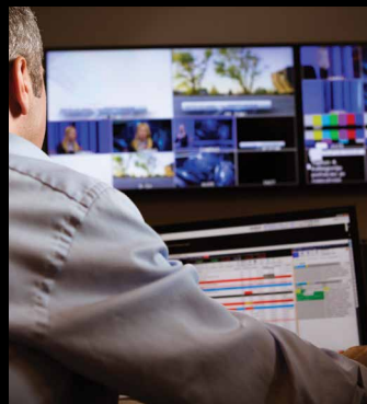
Simplified User Experience