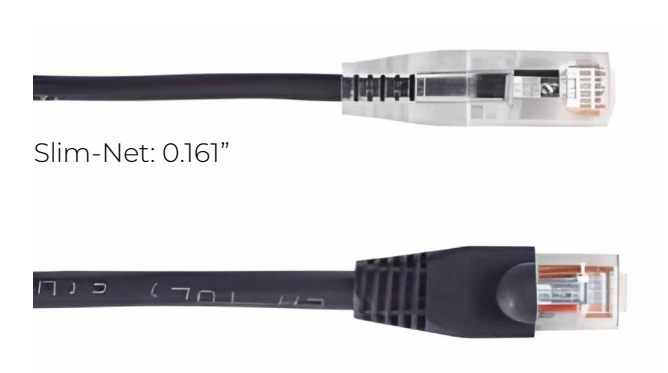
Regular CAT cable: 0.23"