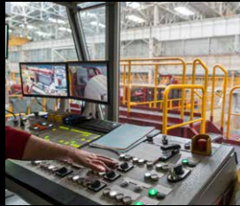
Industry & Manufacturing